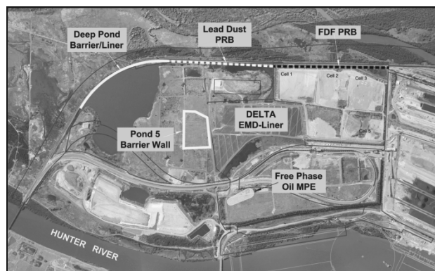
Figure 3. Remediation Plan.

An overall plan showing the location and extent of the preferred remediation options is presented in Figure 3.