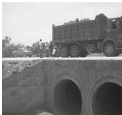
Figure 3. Plate load bearing test at trial section