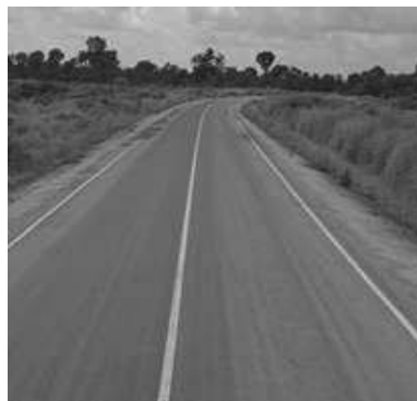
Figure 4. Finished road at trial section