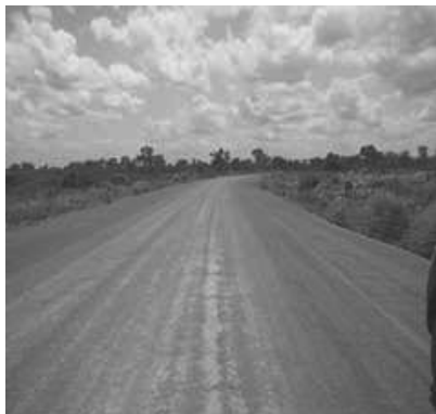
Figure 2. Compacted shale at trial section

Four plate loading tests were carried out within the 100m stretch. Results are presented in Figure 1. Generally, the modulus of subgrade reaction ( k - \text{kN/m}^3 ) is the ratio of loading stress ( p ) at 1.25mm average settlement to 1.25mm. The loading stress is determined from the load – settlement graph at average settlement of 1.25mm. It is observed from Figure 1 that 3 out of 4 (75%) of the test did not attain the 1.25mm settlement criteria at the ultimate stress of 900\text{kN/m}^2 . However at chainage 29+637, k value is estimated as 272\text{MN/m}^3 . This value may be considered as lower bound value for the test section and gives an indication of very low or negligible settlement of a compacted layer. The graphs also indicate that no distinct shear failure occurred and so the final load could be considered as the ultimate load. The finished road of the trial section is presented in Figure 4.